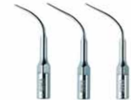
Swiss Instruments A, P, PS